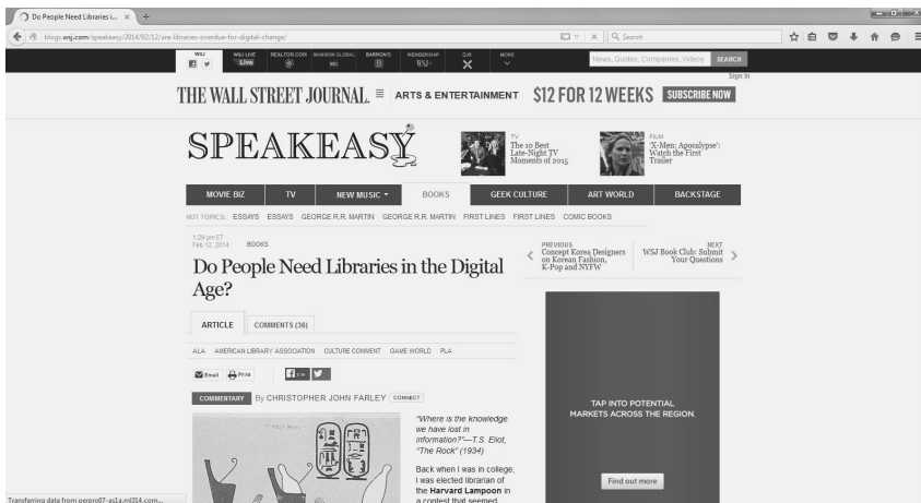
Fig.1 Screenshot of Wall Street Journal

Even as we recognise the fact that dealing with change is not something new for information professionals, the rate at which changes are taking place since the advent of the Web and digital technologies has been incredible and mind-boggling; not only this, the nature of changes have been fundamental and sweeping, raising many questions and suggesting the need for a broad-based approach to design of education programmes for information professionals. In the following paragraphs we will briefly visit some of the major changes: